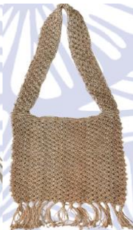
Gents side bag Code: SE-0011-M Size: 36x30x107 cm