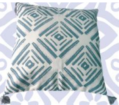
Cushion cover (cotton canvas) Code: SE-9HL27 Size: 45x45 cm