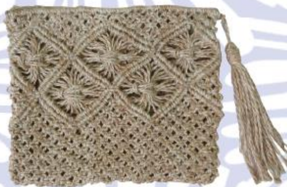
Makram bag hand purse Code: SE-008-M Size: 19x24cm