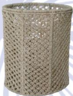
Makram basket Code: SE-001-M Size: 30x25 cm/Dia