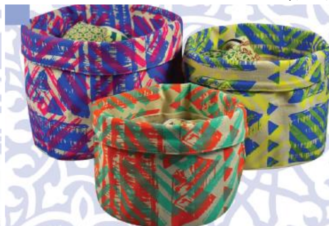
Duo basket (canvas cloth) Code: SE-58GF10/A/B Size: 30x30/25x25/20x20 cm