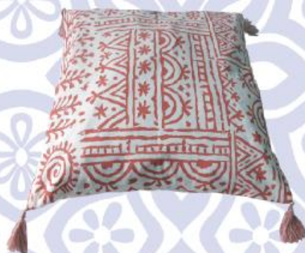
Cushion cover (drill cloth) Code: SE-9HL22 Size: 45x45 cm