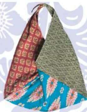
Triangle shoulder bag Recycled sari Code: SE-16 HL Size: 28x62x56 cm