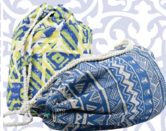
Duffle sholder bag (jute cotton & canvas cloth) Code: SE-434HL3/434HL2 Size: 40x80x25 cm