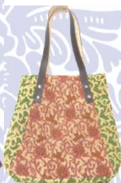
Square bag (recycled sari) Code: SE- 72-AB5 Size: 25x47x17x25 cm