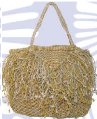
Makram sojaru bag Code: SE-009-M Size: 38x46x51 cm